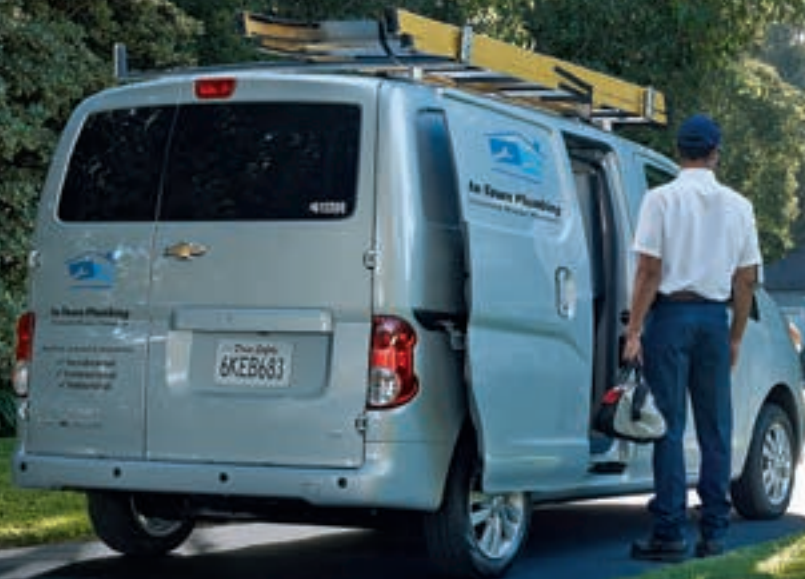
City Express with available features.